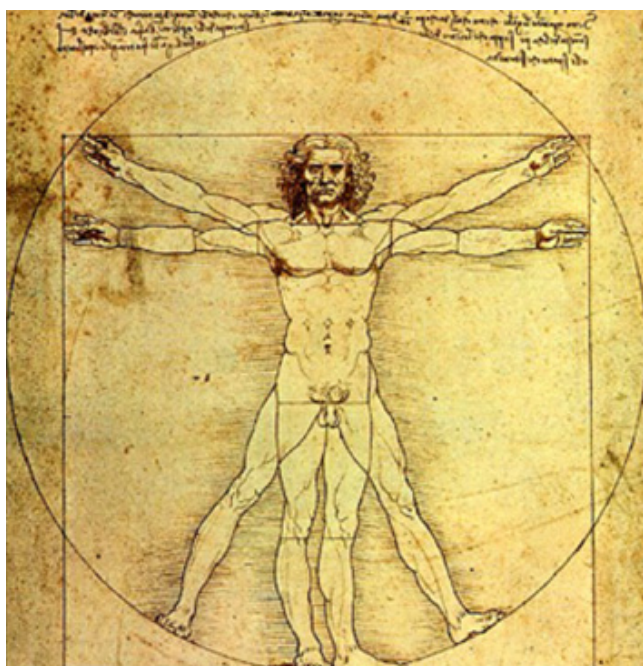
Figure 2. Leonardo da Vinci's Vitruvian Man